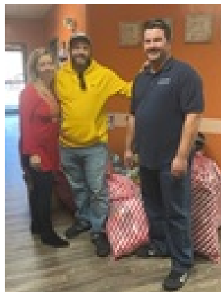
Columbia IL Scouts collected food for us.