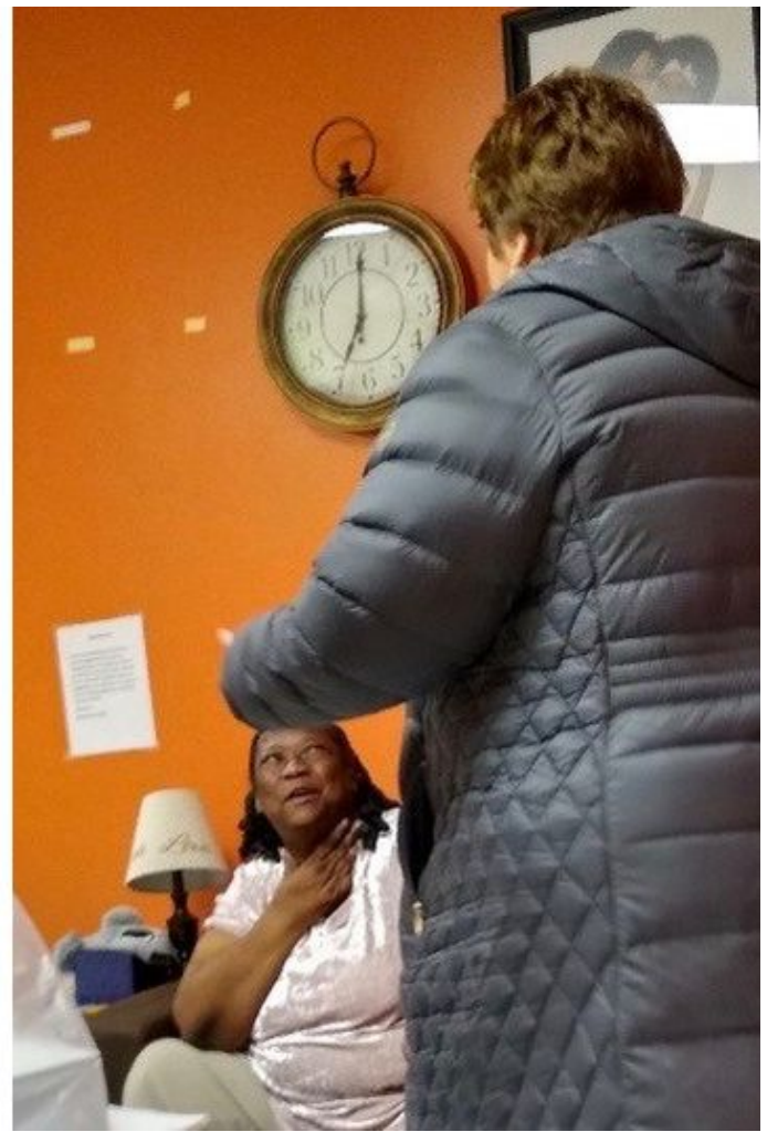
Members from St. John UCC in Maeystown stopped by to bring us gifts and spend some time with us. We loved their smiles and hugs!