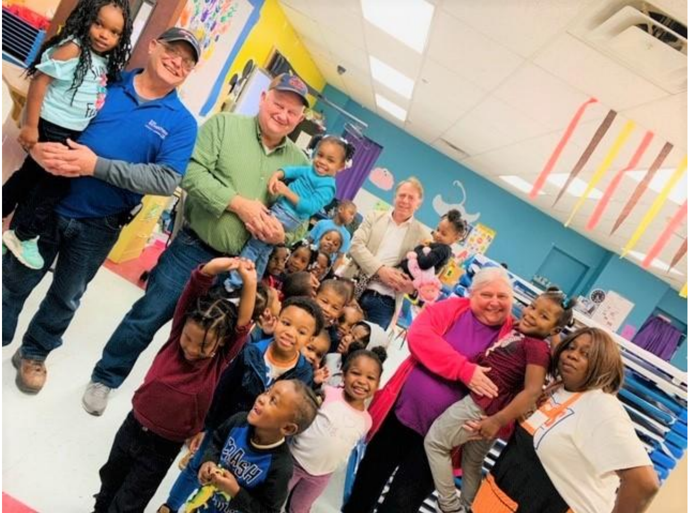
Friends from Peace UCC in Webster Groves, MO brought things for us and stayed to play!