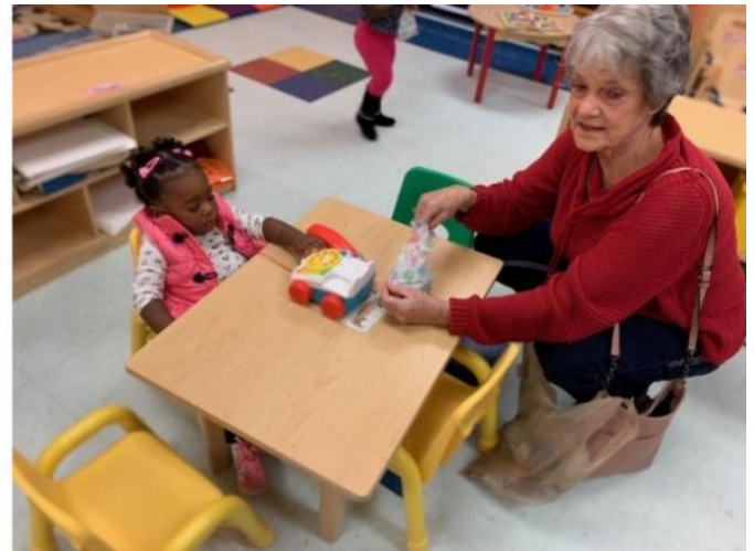
Many more visitors came to see us. We love our visitors!