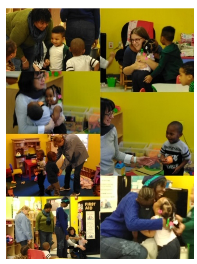
Employees of American Bottoms bring hugs and gifts!