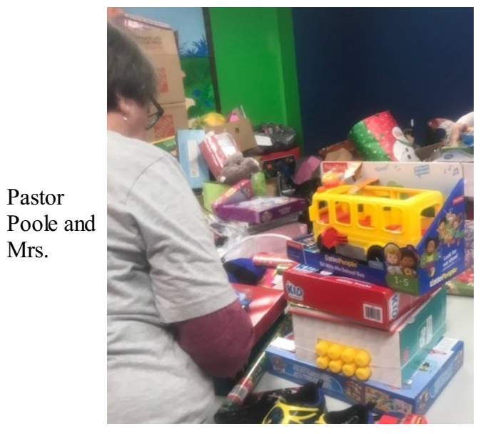
Time to wrap!

We ask that you remember to include Uni-Pres Kindercottage in your will or trust documents. We would be ever so grateful! Thank you!